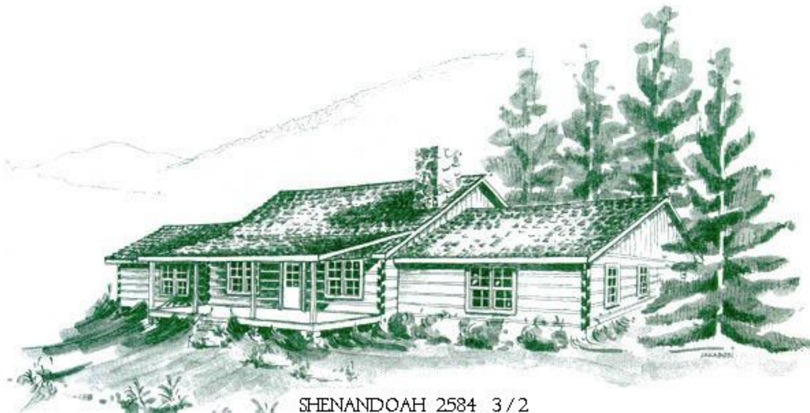
SHENANDOAH 2584 3/2